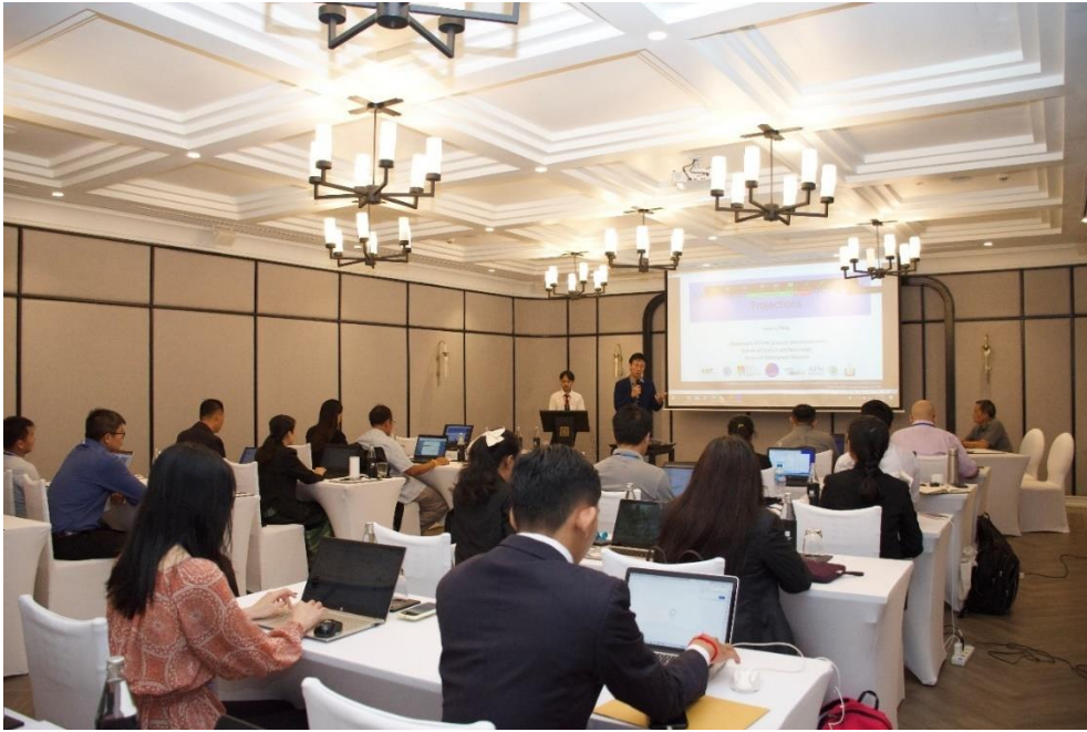
Day 3: Training and certificate delivering