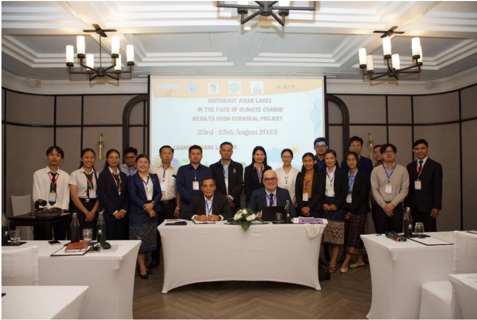
Day 2: training