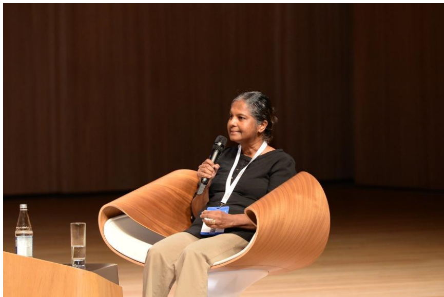
Describing climate action by University of Colombo and the impact of collaborative research projects, particularly the APN-funded collaborative research project involving four South Asian countries.