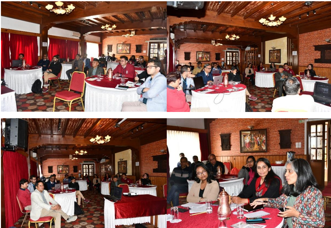
Participants discussing on project findings and way forward.