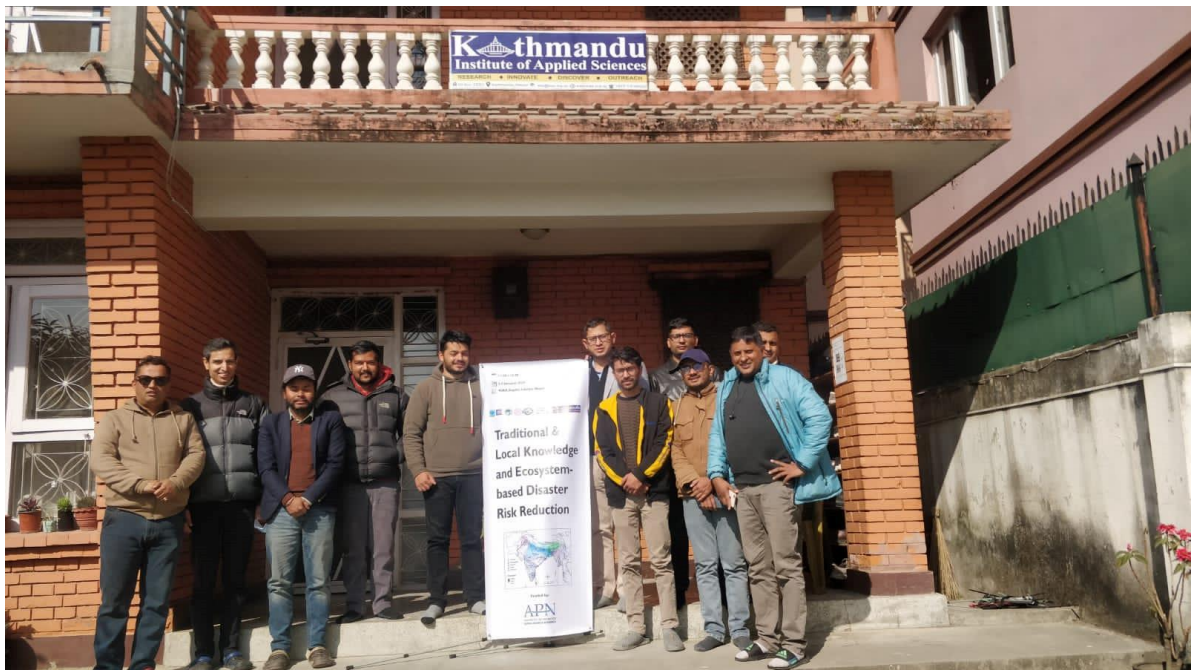
Training participants giving a pose