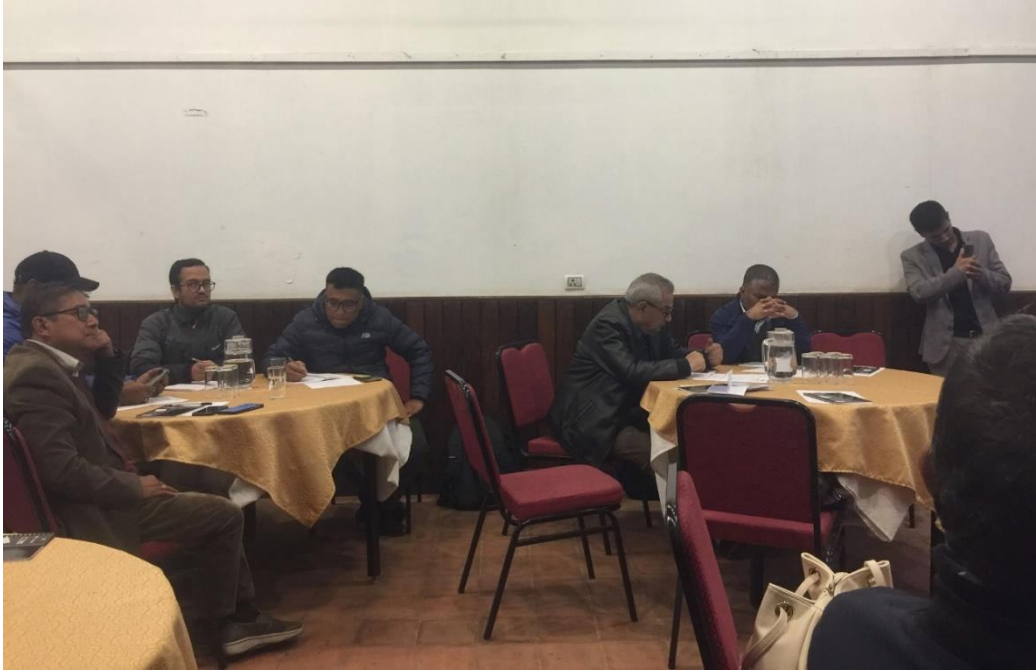
Participants in the workshop