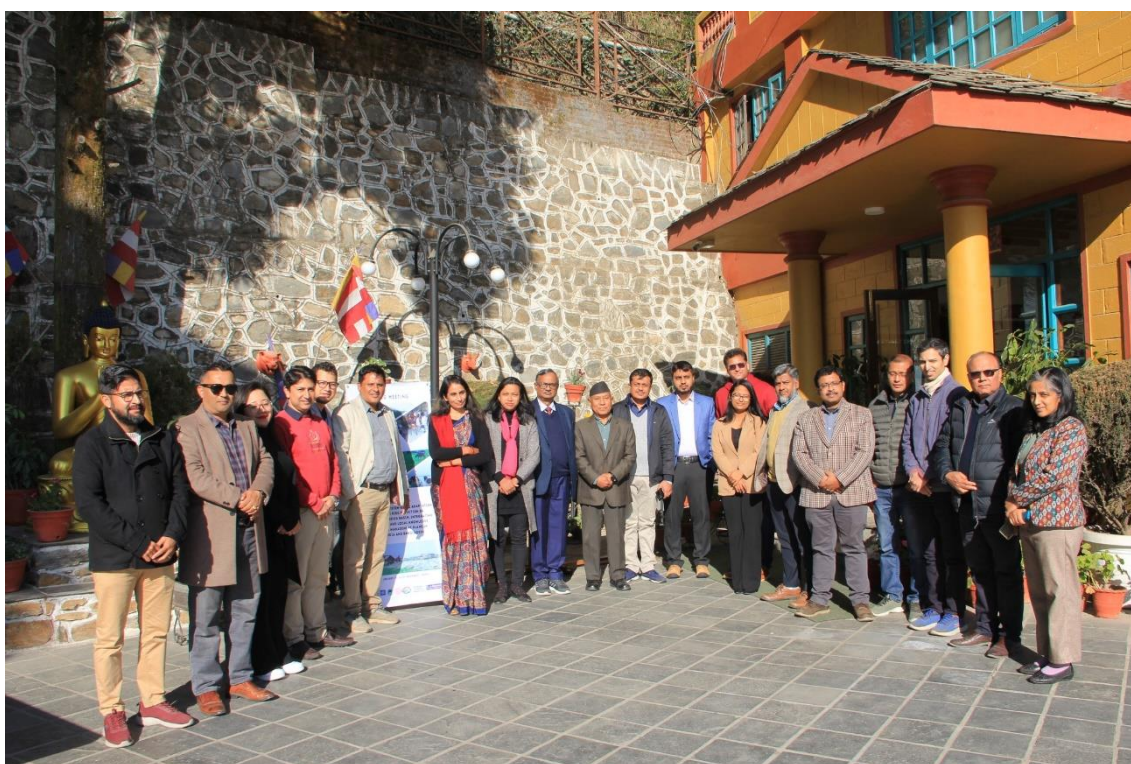
Participants in the closing workshop giving a group photo.