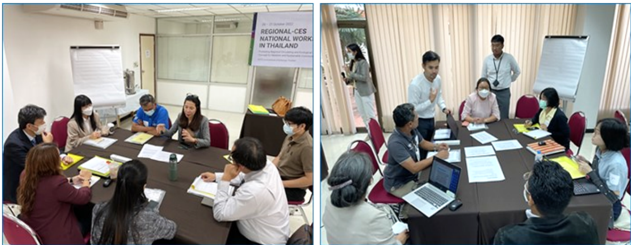
FIGURE 3. Group Discussions during breakout sessions.