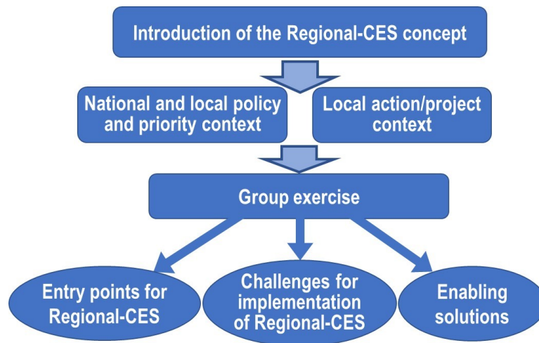
FIGURE 2. Framework of country workshops on Regional-CES.