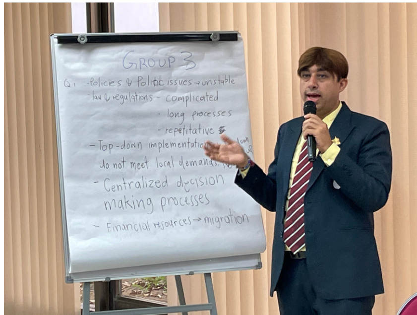
FIGURE 5. Group discussion report of the identified challenges to Regional-CES application.