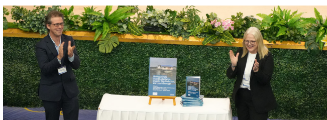
» Unveiling ceremony of the book.

This landmark publication is a major output of APN's Climate Adaptation Framework, established in 2013 to address the increasing frequency and intensity of climate-related risks in the Asia-Pacific region. The book explores the interlinkages between climate change adaptation, disaster risk reduction and loss and damage, offering practical insights drawn from field-based research and policy engagement. It features 12 case studies from South and Southeast Asia and provides sector-specific perspectives spanning agriculture, rural livelihoods, energy, infrastructure and natural resource management. The publication serves as a valuable resource for policymakers, practitioners and researchers working at the intersection of climate change, disaster risk and sustainable development.