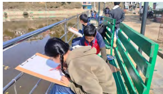
Students drawing for an art competition during the World Wetland Day 2024 celebration in the premises of Nagdaha