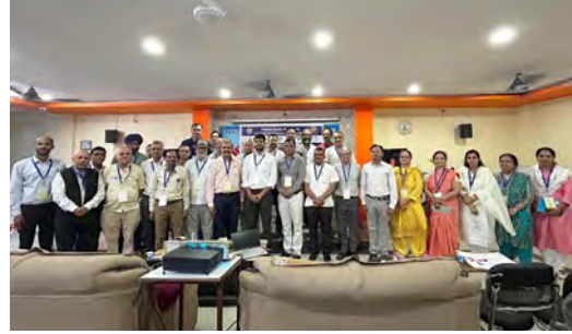
Participants posing for the group photo during the workshop, CURAJ