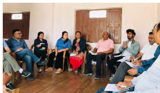
Community members and the SEN team interacting during the interaction workshop at Nagdaha