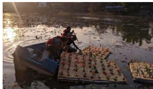
SEN team member installing the rafts in Nagdaha, Nepal with the help of the community member