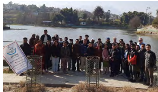
Participants posing for a group photo after World Wetland Day 2023 celebration at Nagdaha