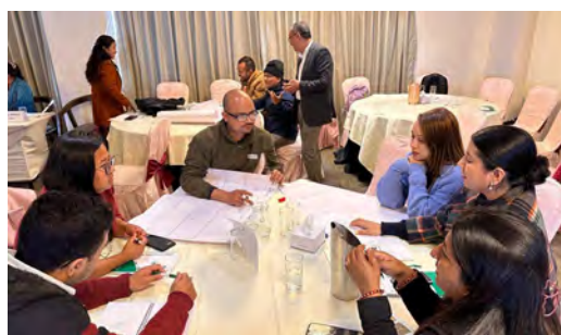
Participants discussing on sustainable wetland management during a group work at the policy workshop in Nepal