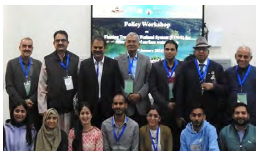
Participants posing for a group photo at the policy workshop in India

https://docs.google.com/document/d/1QuS-DsSsHQIKgIbiGW6rSa5JZPMD7xB8/edit