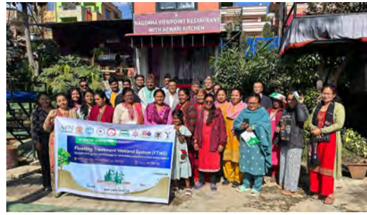
Participants posing for a group photo after successful completion of community workshop at Nagdaha, Nepal