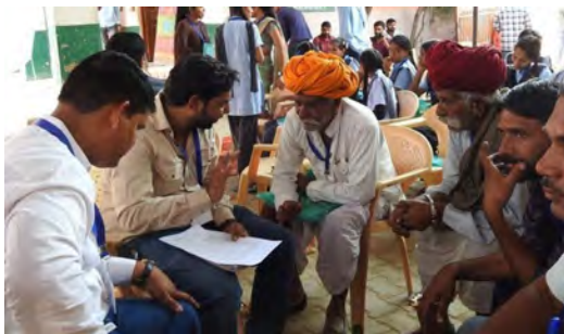
CURAJ team members interacting with community members during community workshop in India