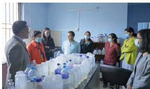
All participants visiting the lab of the KVWSMB as a part of training