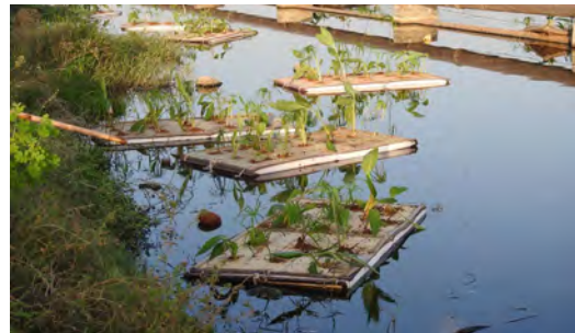
Installed rafts in Nayagaon Talai, India