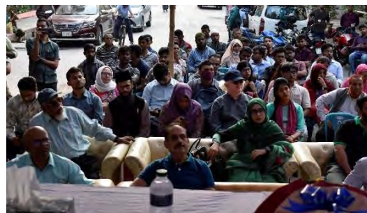
Participants during the community & policy workshop in Bangladesh