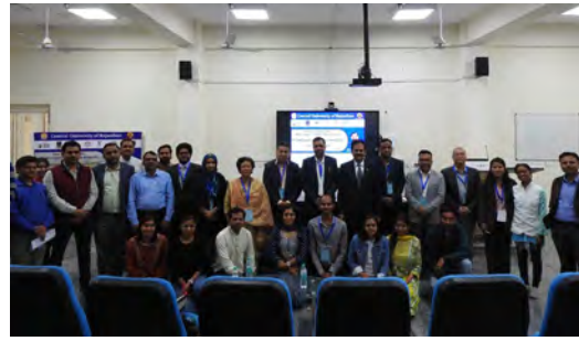
All the participants posing for the group photo after the completion of the workshop