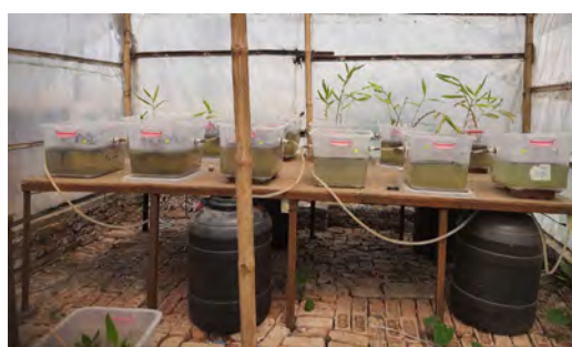
Different materials used for the preparation of microcosm setup in India