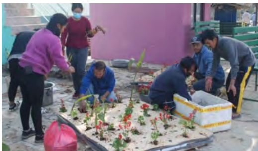
SEN team and community members inserting plants in the rafts before installation in Nagdaha, Nepal