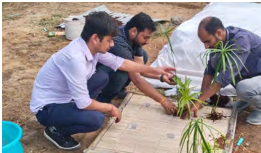
CURAJ team members inserting the plants in the raft before installation in India