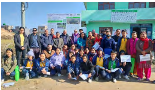
Participants posing for a group photo at the end of World Wetland Day 2024 celebration at Nagdaha