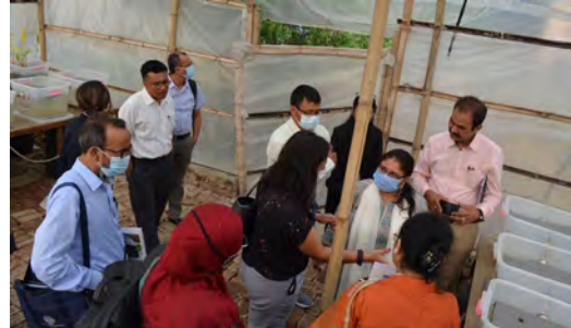
Participants visiting the FTWS microcosm experimental setup at the premises of KVVMB, Kathmandu