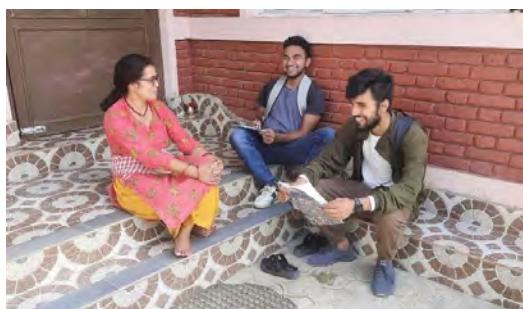
Surveyors conducting a questionnaire survey with community members at Nagdaha

A community survey was conducted from 21-30 August 2023 by SEN at Nagdaha, Nepal. The survey aimed to analyze the level of knowledge and understanding of community members on FTWS technology. The objective of the survey was also to clear doubts and misunderstandings about the FTWS among the community members and to communicate the exact science behind the technology to further prevent any misinterpretation. A questionnaire survey was done with the local community members and stakeholders within a radius of 350 meters from the center of Nagdaha. The survey was conducted in 104 households out of 521 households, inside the selected zone, and showed that 88% of the respondents were familiar with the installation of floating rafts in Nagdaha but had very few concepts about the technology behind it. 74% of the respondents knew about the beautification purpose of the floating rafts. The survey helped the communities to have a better understanding of the technology.