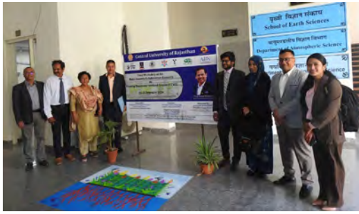
Collaborators posing for a group photo in front of the program banner