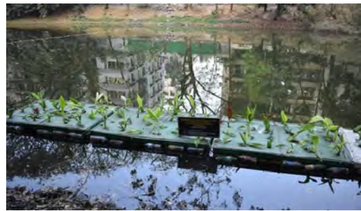
Installed rafts in Dhanmondi lake, Bangladesh