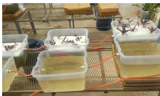
Microcosm setup with different treatment units inserted with plants in Bangladesh