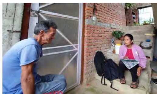
Surveyors conducting a questionnaire survey with community member at Nagdaha