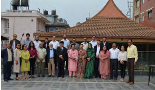
Participants, collaborators, and guests posing for a group photo during the FTWS workshop at the Hotel Akama, Kathmandu

FTWS project execution, and training on water quality analysis from the experts. The collaborators experienced the FTWS activities being conducted in Nepal, discussed each detail about the FTWS technology, and exchanged experiences, plans, and knowledge about the project for ways forward in other project countries.