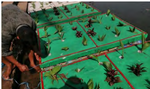
Preparation of raft inserted with plants for installation by DU team in Bangladesh

plants and then installed in the respective lakes. The raft installation aimed at remediating the lake water, checking the survivability of the plants in an open environment, raising awareness in the community about the technology, and knowing the beauty provided by plants to the lake. The study showed a decrease in nitrate levels by 55 mg/l, and phosphate levels decreased from 1.4 mg/l to 0.1 mg/l after 60 days of study in CURAJ. Plant species like Canna indica survived the open environment while plant species like Salvia splendens didn't survive. The community members became aware of FTWS technology and the lake was beautified by the flowers of the Canna indica plants when they bloomed.