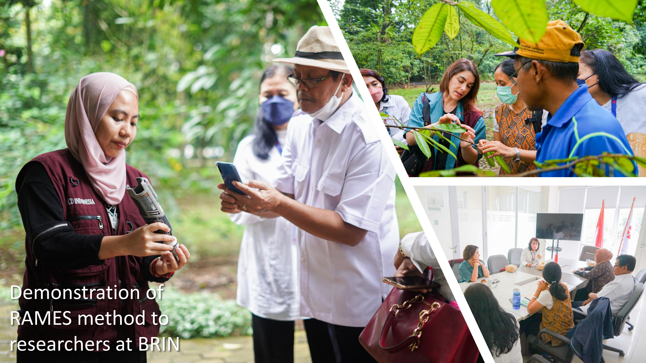
Demonstration of RAMES method to researchers at BRIN