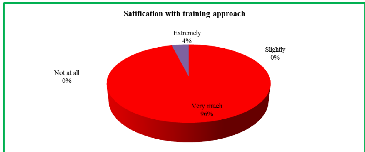
Graphic02: Percentage of the trainees satisfied with the training approach

Most of the trainees (96%) agreed that they were very much satisfied with the training approach. The training approach consist of lectures with PowerPoint presentation, group discussion, group work, and role play which allowed them to had enough time to ask, answer, explain, or communicate in the training. As the positive result, there were no participants who not satisfy to the training approach therefore the training was very successful.