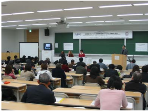
Workshops on Day 2