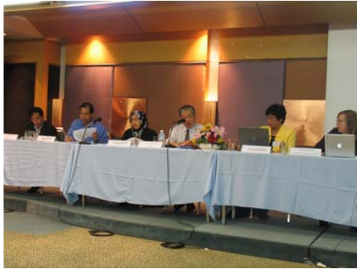
Satellite Symposium B-1

The need to establish flexible guidelines of environmental education applicable to stakeholders that will cut across all Asian countries was also emphasized. Lastly, it was realized that in order to acquire quick information on environmental education, an on-line TV net meeting system between Japan, Malaysia and other countries concerned with the project must be set up.