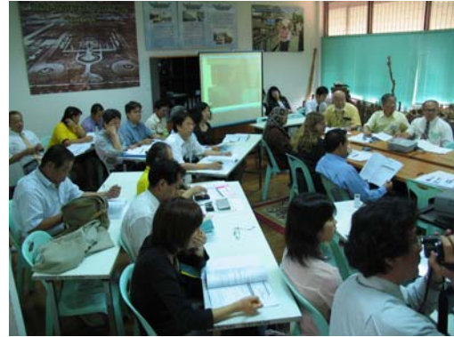
Satellite Symposium B-2