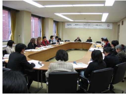
A specialist's study meeting on Day 3