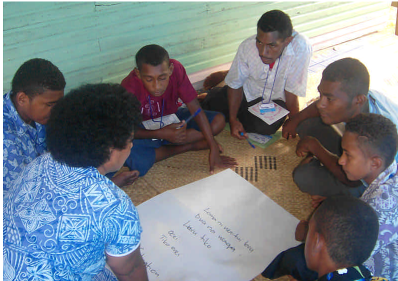
Fig. 3 (Participants in group discussion)