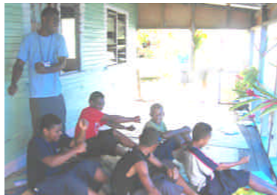
Fig. 5 & 6 (Simulating scenarios)