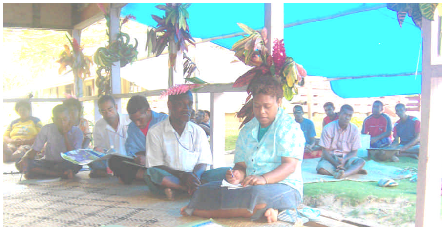
Fig. 1 Naboutini workshop participants take note

The presentation on Climate Change and Variability included providing definitions on climate variability and change, the causes, impacts and what they can do to mitigate or adapt. A description on the Kyoto Protocol was also provided to enable participants understand Fiji government's stance regarding the global environment and for them to support and play their part in mitigation. A holistic integrated view of the hydrological cycle and biodiversity (atmosphere, land and sea), nature's balance and relationships, interconnectedness, man's activities affect nature's balance causing climate to change, biblical perspective on individuals responsibility towards environmental stewardship. Participants expressed they felt very empowered, many indicated their minds were broadened, learning and fully understanding climate change for the first time.