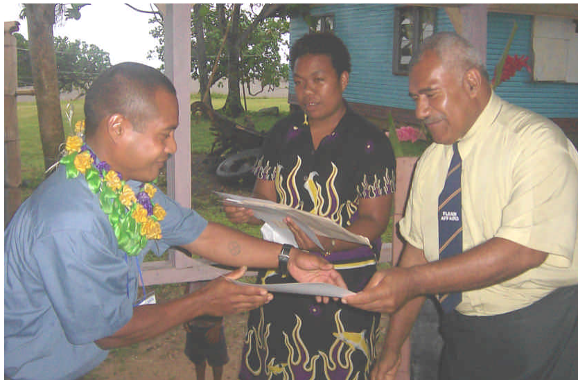
Fig. 6 (The Chief Guest, na Turaga Roko Tui Cakaudrove hands out certificates)

After formalities, the workshop participants performed their two dramas and songs. The chief guest was the Roko Tui Cakaudrove or the Cakaudrove Provincial Chief Administration Officer. In his closing remarks he confirmed that Cakaudrove has a healthy and wealthy environment. He reminded everyone that their forefathers had a close relationship with the weather and the climate which guided their way of life e.g. planting and fishing. Today, people and climate have changed. People should now live prepared lives eg. preparedness with e.g. food stock, water, evacuation centre etc. They should not be relying on the government and Red Cross but do what they can to help themselves first. Communication amongst the village members is very important to save lives and their resources. He urged participants to attend a lot of workshops related to the ones in this workshop so they know what to do to secure themselves and their natural resources and for the benefit of their future generations. After the chief guest's speech, he handed out certificates to participants.