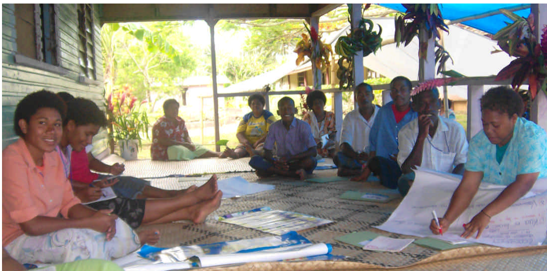
Fig. 4 (Participants)