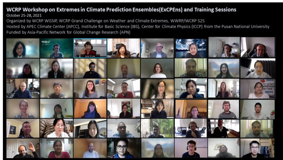
FIGURE 2. Group portrait of ExCPEns Workshop and Early Career Scientist Training Sessions participants.