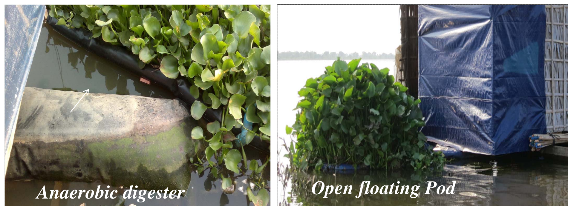
Figure 2. The HandyPod contains and treats household wastewater to a level safe for recreational use.