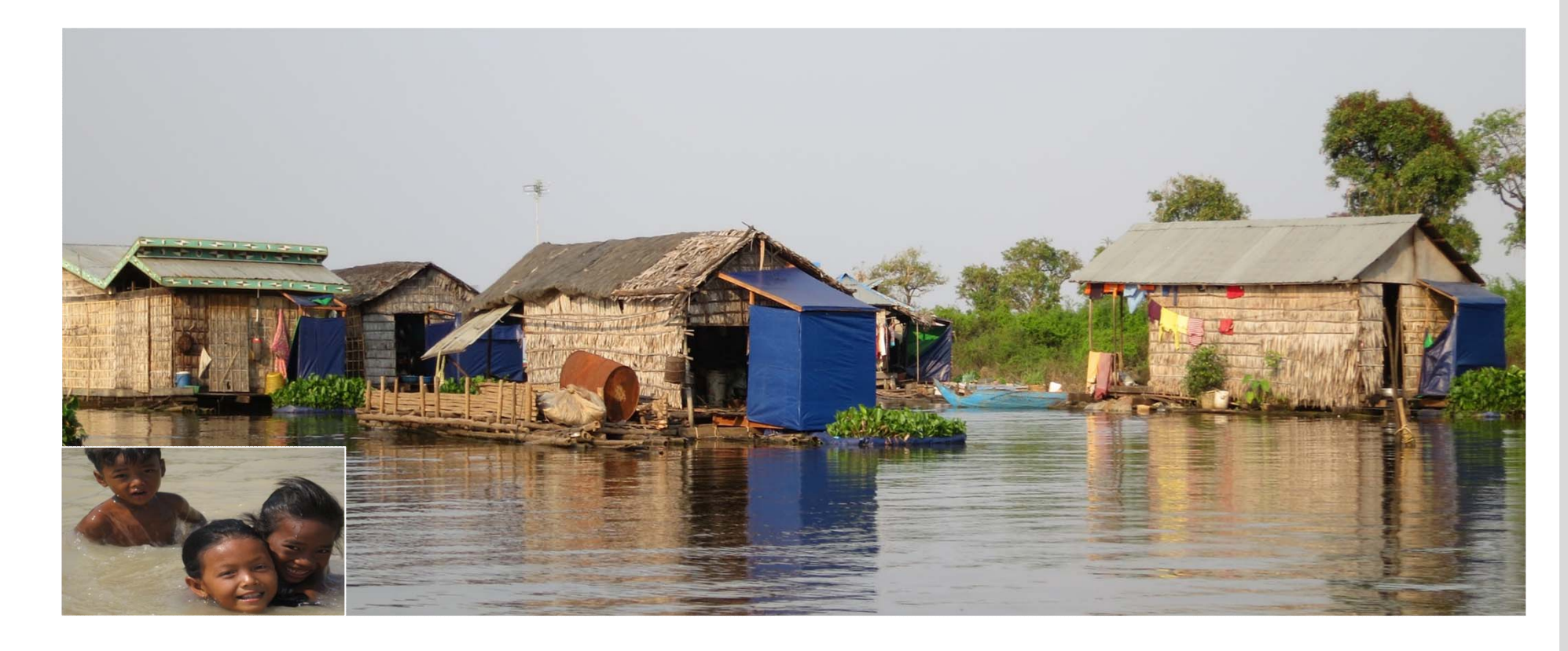
Figure 1. Children spend hours playing in contaminated water