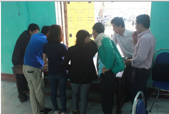
Discussion on identifying main risks and consequences associated with natural disasters and climate change within your community at Group 1