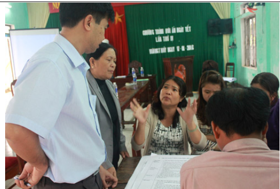
Discussion about assessment of L&D in your community due to disasters at Group 2