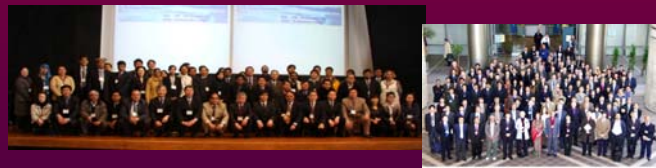
... and regularly attends GEOSS Symposia