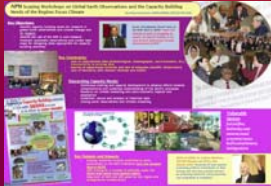
Outputs of two scoping workshops (in 2005 and 2006) were incorporated into the GEOSS' "First One Hundred Steps" presented at GEO IV