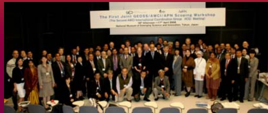
1 st Joint APN and GEOSS/Asian Water Cycle Initiative (AWCI), 2008 ...