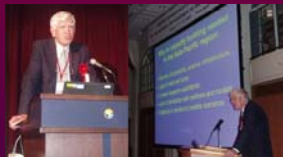
GEOSS Symposium on Integrated Observation for Sustainable Development, 2007