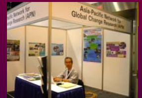
APN Exhibition at GEO VI, 2009