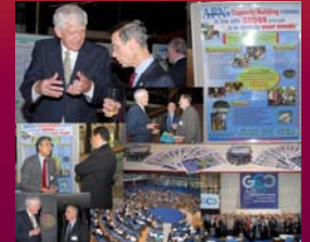
APN Exhibition at GEO III, 2006